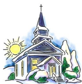
Christmas Day Worship Service

Our Christmas Eve Service with Holy Communion will be Saturday, December 24 th , at 5:00 P.M. Join us for this service as we light the Christ candle and celebrate the birth of our Savior, Jesus Christ. This service will be available virtually on Facebook.