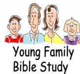
Young Family Bible Study

We will gather for Young Family Bible Study for those families with young children on Wednesdays, November 5 th and 19 th , at 6:00 PM for Bible study, crafts, and music. It's always a great time to gather and see the children grow in their faith.