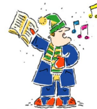
Join Us for Caroling

Youth will continue collecting money for the John 3:16 Center Christmas on December 7 th . We will go to lunch immediately after church, and then shop. We will have our Christmas party on Sunday, December 14 th . We will have dinner this week. Youth are invited to go Christmas caroling on Wednesday, December 17 th .