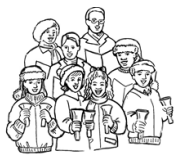
We're Going Caroling

There will be no Choir or Prayer & Bible Study on Wednesday, December 18 and December 25 .