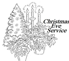
Christmas Eve Service

Everyone is invited to our church-wide Christmas Breakfast on Sunday, December 22 , beginning at 9:00 A.M. This breakfast will extend into the Sunday School hour. After breakfast we will take some time for celebration and thanksgiving. We hope you will be present for this time of fellowship hosted by the Missions Committee.