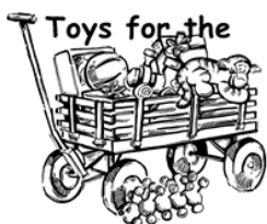
John 3:16 Center

The Christmas Card Mailbox for you to “mail” your Christmas cards to church members “in house” begins Sunday, December 1 . You may bring your Christmas cards to the vestibule for distribution to members. We’ll make sure our Homebound receive their cards as well.